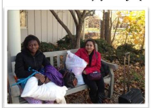
Mount Holyoke College in South Hadley, MA