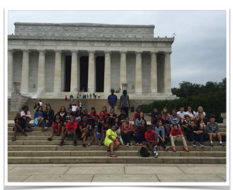
Upward Bound at the Lincoln Memorial in D.C.!

"Show up everyday with a positive attitude and avoid doing the bare minimum because you get out of life what you put in."