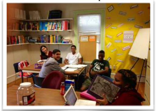
Collaborative work space